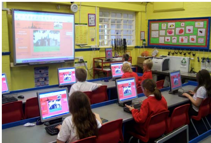
Year 5 during an ICT lesson in the Suite using the interactive Smartboard

We launched a Learning Platform in September 2008, which is an online tool, allowing children protected access to the school community. We are developing a range of online learning activities together with an information area to supplement our existing website.