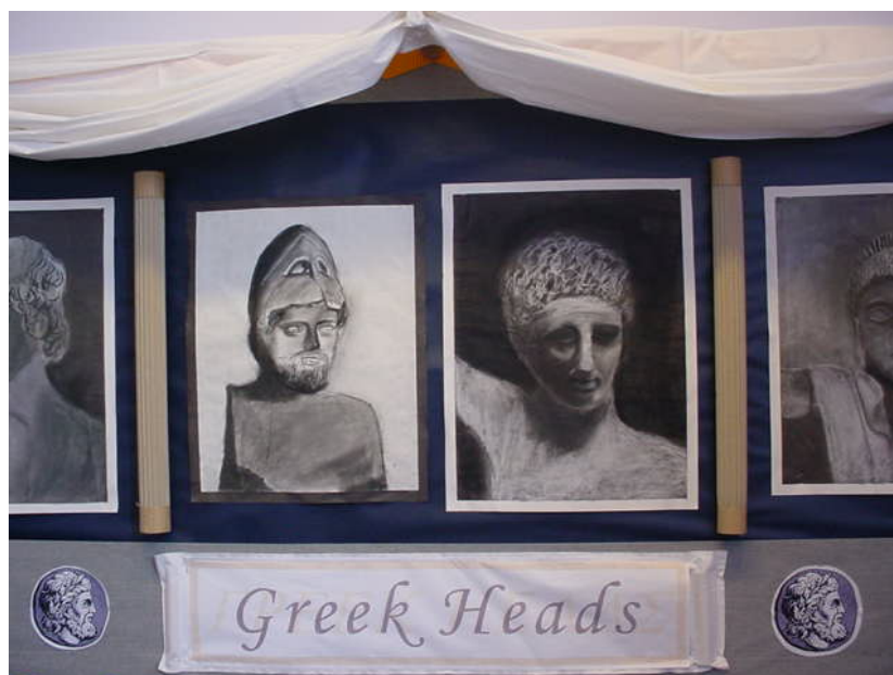
A display of Year 6 artwork

Art activities will relate closely to the topic work being covered by each class. Pupils will develop their visual perception and skills associated with investigating and making art, craft and design. They will use a wide range of media in 2D and 3D work. Pupils will also be introduced to artistic traditions and our artistic heritage to aid them in their knowledge and understanding of art. The standard of our art work is very high and our displays of children's work receive many positive comments from visitors.