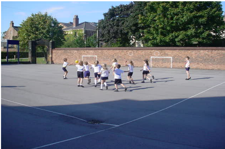
Year 3 taking part in an outdoor PE lesson

Key Stage 2 pupils also have the opportunity to go swimming on a regular basis, which takes place during the school day. Older pupils may take part in team games with other schools, which usually take place after school. There is a range of sporting extra-curricular activities on offer to pupils in both Key Stages.