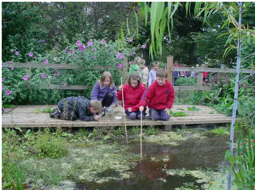
Children visiting Scarcroft School Allotment to carry out pond dipping

The school has developed a nearby allotment with the help of FoSS (our parent group), which enables our children to carry out practical investigations, including growing things, minibeasts and pond life.